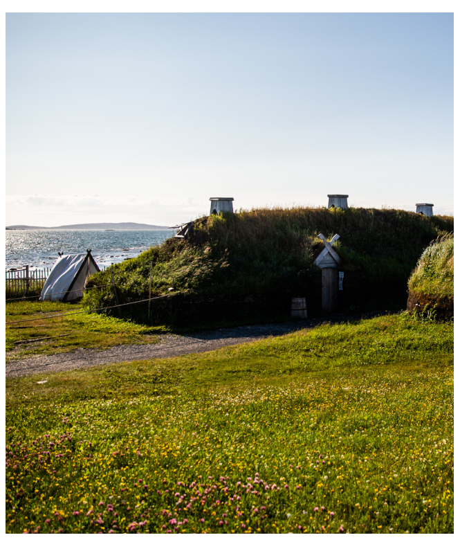
©Julia Endicot @L'Anse aux Meadows National Historic Site and World Heritage Site

Investing in UNESCO sites is a demonstrated commitment to preserving the culture and natural heritage that each site holds for the benefit of present and future generations. Together the 13 UNESCO sites represent sustainable development, traditional and contemporary Indigenous stewardship, history, biodiversity, geology and human achievement that contribute significantly to the Atlantic regional identity and Canada's global heritage.