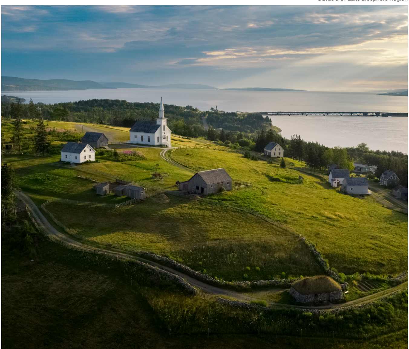
@Bras d'Or Lake Biosphere Region

World Heritage Sites (WHS): World Heritage Sites are places of outstanding universal value to humanity that have been inscribed on the UNESCO World Heritage List to be protected for future generations to appreciate and enjoy. These sites represent some of humanity's most outstanding achievements and nature's most inspiring creations. In Atlantic Canada, each WHS is governed by a management authority such as Parks Canada.