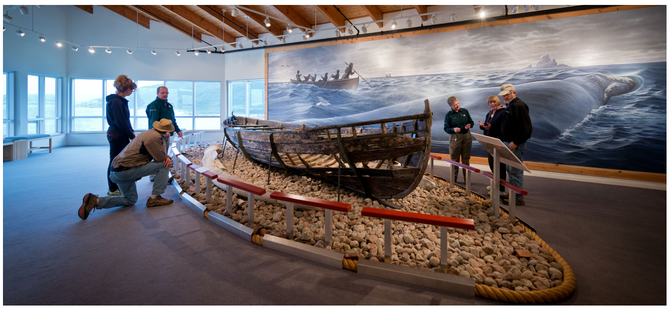
©Chris Reardon @Red Bay Basque Whaling Station National Historic Site and World Heritage Site