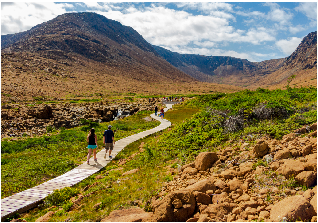
@Gros Morne National Park and World Heritage Site

Rising Tides, a Regenerative Tourism Strategy for the Atlantic Canada UNESCO Tourism Corridor was developed through Destination Canada's Tourism Corridor Strategy Program, which was created to enhance the resilience of the tourism industry by developing multiple corridors across Canada. The approach emphasizes collaboration between community partners, especially across provinces and territories, and encourages investments that benefit Canadians. This project defined a vision for partners and stakeholders, set out an implementation plan to execute the Strategy, and identified investment needs and economic potential for sites and stakeholders. The Corridor is being developed alongside two other 2023 corridors: Sustainable Journeys from Prairies to Pacific, and Northern Indigenous Tourism Lodge Network.