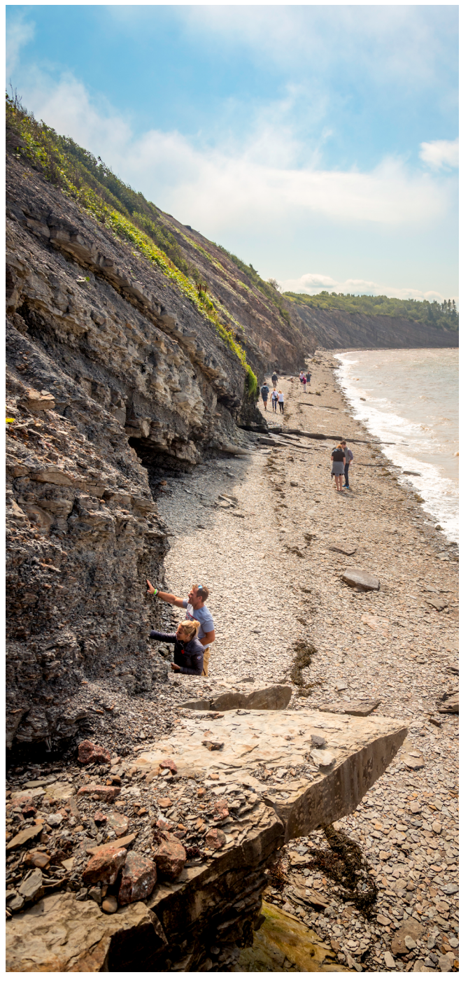
@Joggins Fossil Cliffs World Heritage Site