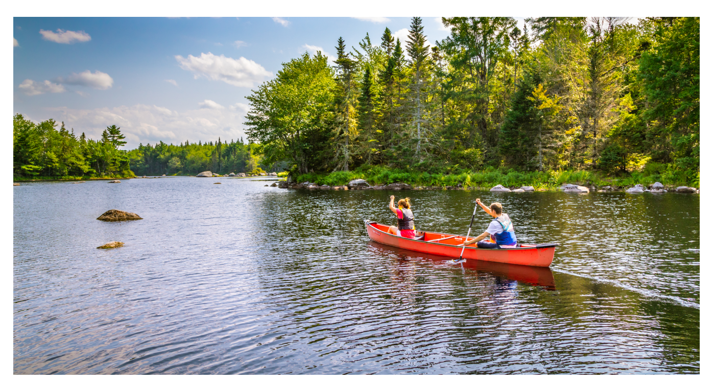
@Southwest Nova Biosphere Region